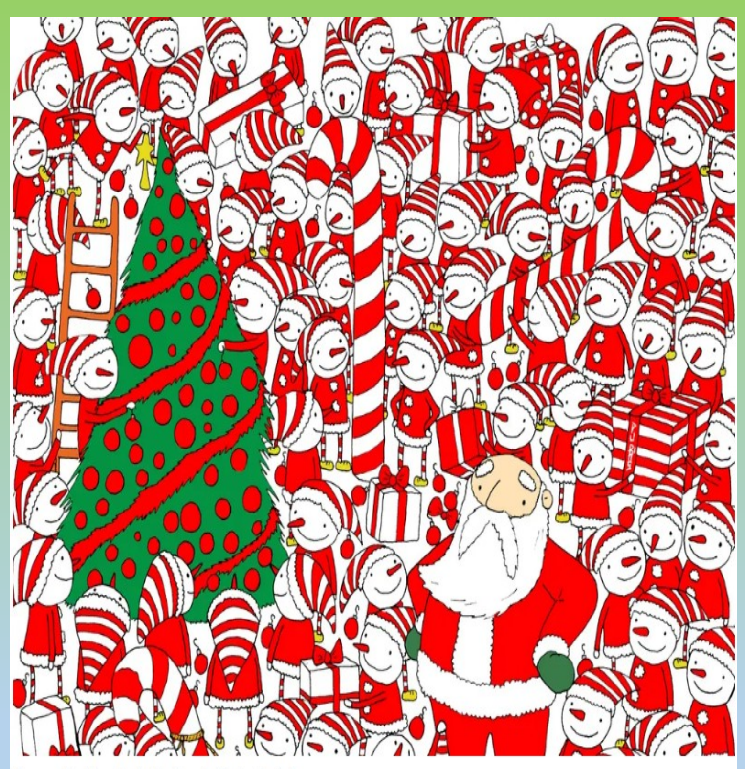
Can you find Santa's hat?