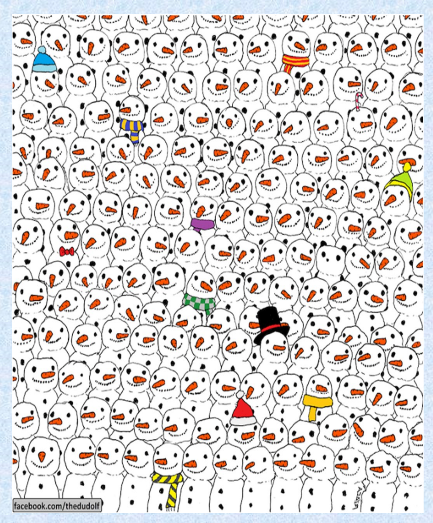
Never too early for a few snowmen!